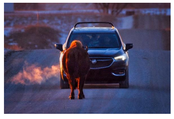
"Road Block" by Greg Punelli